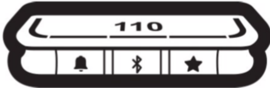
(A) Reminder (B) Bluetooth (C) Favorite